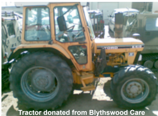
Tractor donated from Blythswood Care

also help with their farming to make their projects more self-sufficient. Pamoja has been asked to cover the costs of transporting a 40 ft container, which will be around £6500, including clearing the container in Kenya. We are also hoping to put a water bowser in the container and perhaps even a disc plough!