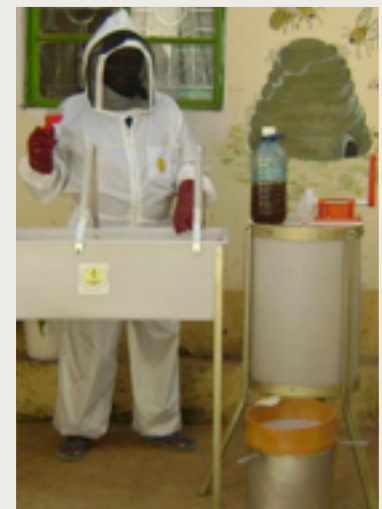
honey purifying machine