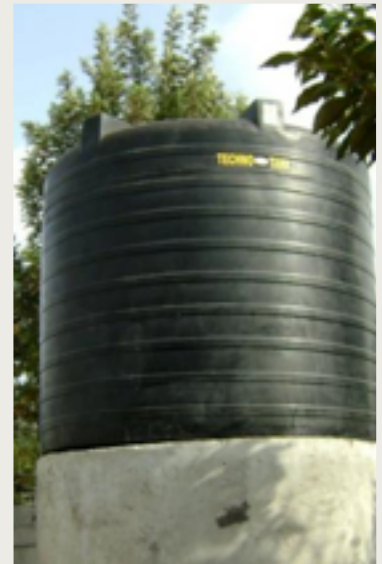
10,000 L water tank

Being able to purify the honey means that they will get a better price for it.