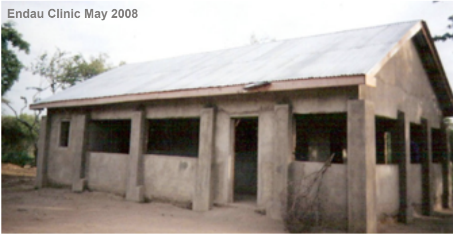
Endau Clinic May 2008

Progress on the construction of the clinic continues with the main building now 95% complete. Work is already underway on two rooms for the nurse who will be appointed soon. We have not yet fixed a definite opening date but hopefully January 2009 will see the clinic open and providing help to a needy and isolated community. We still have to provide all the furniture, medical equipment and medicines needed to open so if you would like to contribute towards this do let us know.